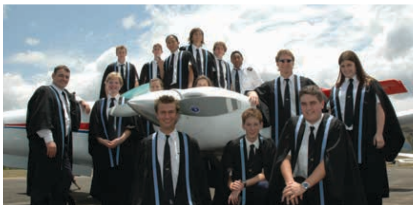
School of Aviation students 2003.