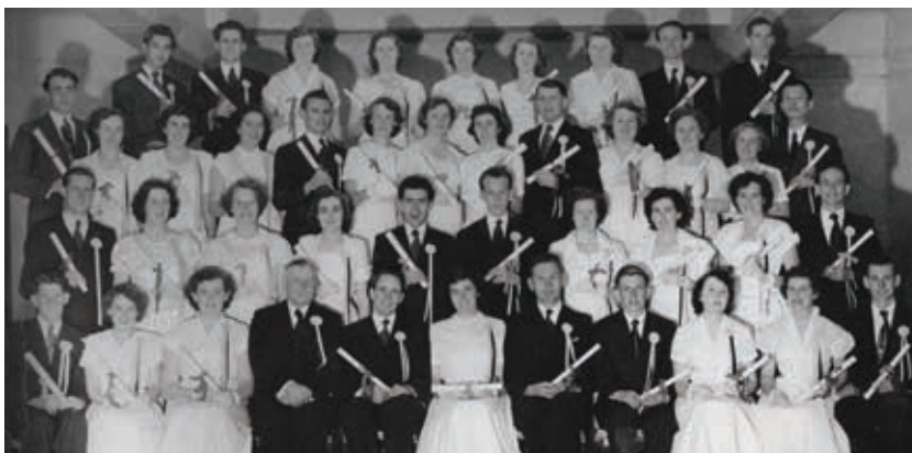
Class of 1953.