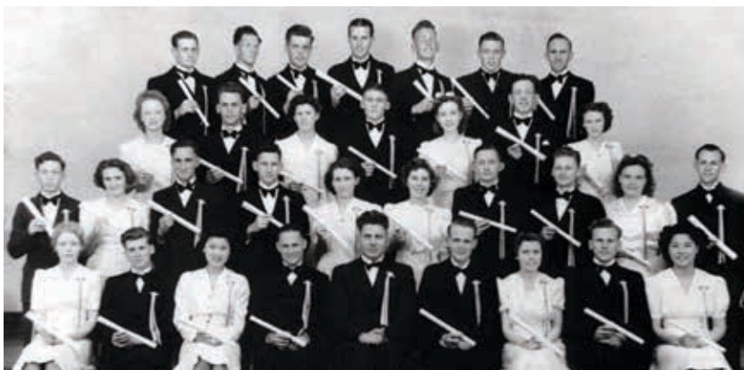
Class of 1943.