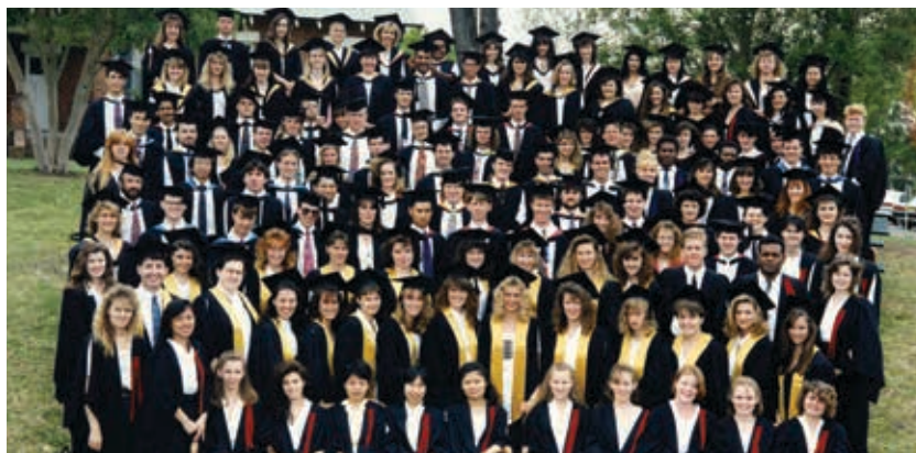
Class of 1993.