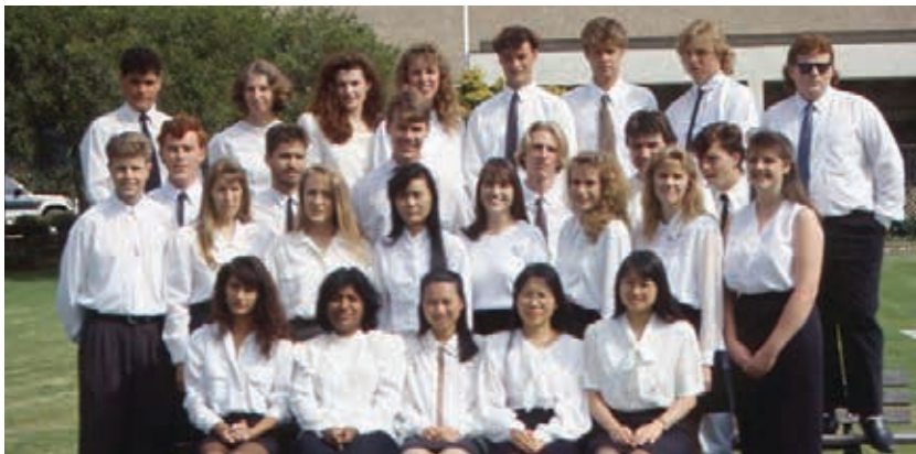
Nursing class of 1983.