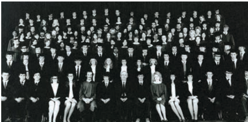
Class of 1973.