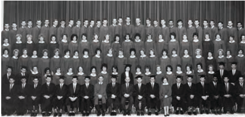
Class of 1963.